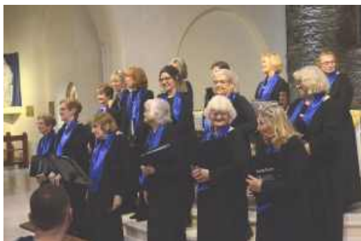
Pictured right: the South Rosen Choir in St. Michael's Church.