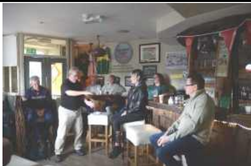
Pictured left: Irish Lessons in Dan Murphy's Bar.