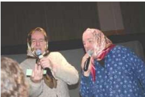
The 2 Mary's drawing the raffle