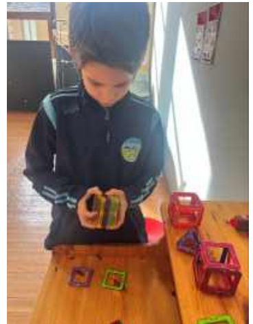
Some pictures of Halloween activities in the Rainbow Room.