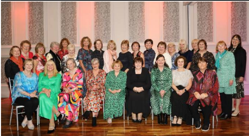
Blackwater Women's Group are celebrating their 21st Anniversary this year. They are pictured here at the Harvest Dance 2023 in Kenmare Bay Hotel.