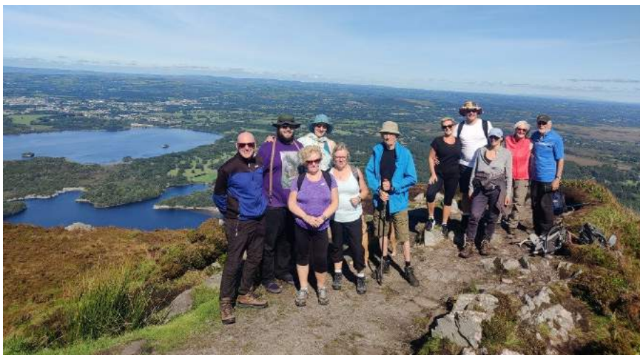
Sneem Walking Club at Torc Mountain

Sneem Walking Club is delighted to have restarted their Autumn/Winter walks, although they have not got off to a great start with the bad weather. We will persevere, however, and where necessary take lower level, shorter walks.