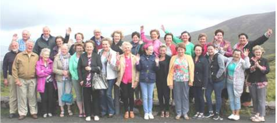
Blackwater Women's Group and Friends Annual Outing August 2017 to Valentia Island and Portmagee.