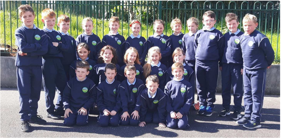
Pictured above are pupils from 2nd and 3rd classes in St. Michael's National School, Sneem wearing their new tracksuits.