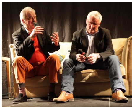
Pictured above Tony Hanahoe and Pat Spillane telling tales from their footballing days.

Next year's festival is on the 11th - 13th November 2016 , save the date in your diary.