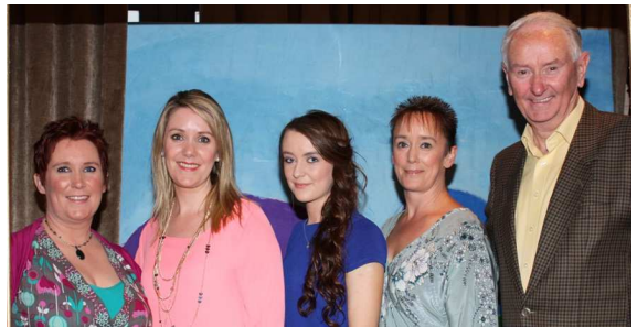
Pictures above from the 50th Anniversary Celebrations.